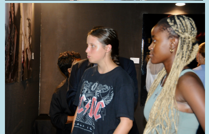
Up and Coming Events

Thursday 28th March Grade 12 final reports Wednesday 27th March Grade 12 ~~Mock Graduation photos Thursday 28th March Grade 12 clap-out parade at 10.30 am Thursday 28th March school finishes at 11 am Monday 15th April school starts at 7.10 am Monday 15th April-Friday 19th April Secondary MAP testing